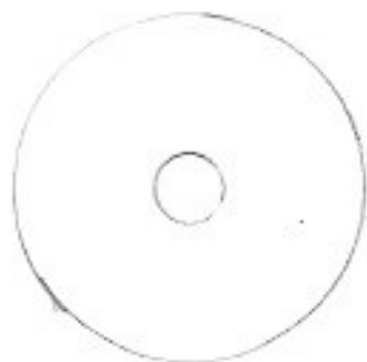
Disc for recess in New end plate